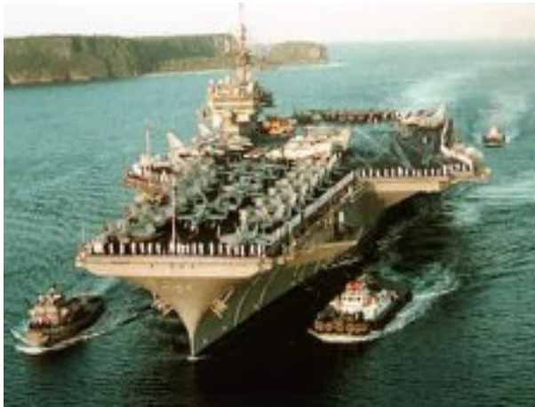
NUCLEAR AIRCRAFT CARRIERS: USS G. Washington & Theodore Roosevelt