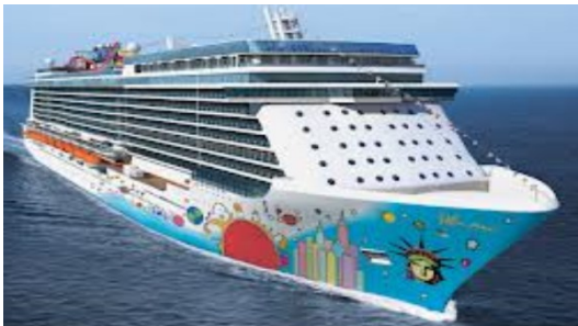
Cargo and tourist ships