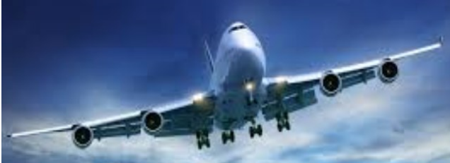
Commercial, private or military airplanes